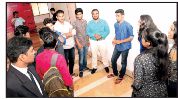
Finalists interacting during the grand finale

All these students agreed that such events must be organised more often as they have a wide reach and help students to evaluate their proficiency skills, and more students should be invited to participate. They look forward to many more of such events.