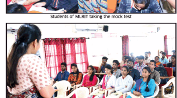
Anurag Group of Institutions's students at the seminar