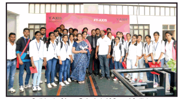
Participants of Aurora Technological & Research Institute