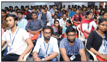
Students listening attentively