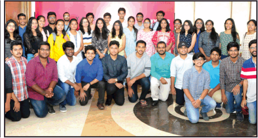
Finalists from the 10 participating colleges