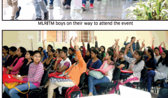
Students of HITAM in full participation mode