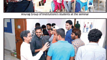
SVIT students all excited to participate