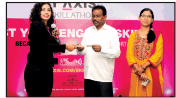
Tombola winning parents receiving gift vouchers