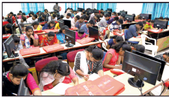
Spoorthy Engineering College students attending the test