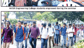
MLRITM boys on their way to attend the event