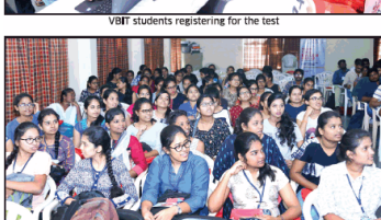
MVSR Engineering College students engrossed during the seminar