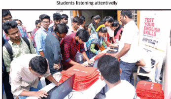
VJIT students registering for the test