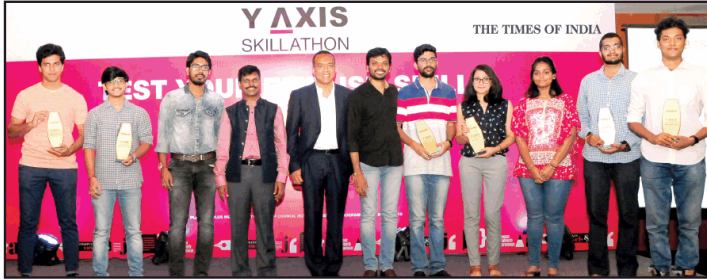
All cheers and smiles: Proud winners posing with dignitaries