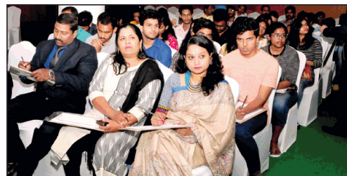
Judges evaluating the Contesting finalists